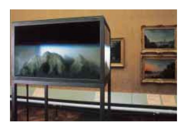
Stolen Sunsets 1996 Glass, water, food dye, salt, fibre glass 45 x 65 x 180 cm Arts Council Collection Installation Private View , Bowes Museum, Barnard Castle, 1996

Mountains (1808), she says, is that this is not an altarpiece depicting the Crucifixion itself, but a landscape with a wooden roadside cross. It is knowingly deceptive. Yet, from the time of its first showing in the artist's Dresden studio, placed between candles on a cloth-hung table, it has invited multiple readings and became known – after its first home – as the 'Tetschen Altar'. Its own sun is setting because the real God no longer shows himself on earth – just the sort of symbolism we are hard-wired to expect in such effects, especially when painted by this artist. His, Neudecker says, is an art of symbol and metaphor; it is not really painting – and she trained as a painter. For this, and for his own radical play with ways of seeing and representation, Neudecker would surely have come to Friedrich even had he not been so firmly and contentiously marked on the German cultural map. In her tank piece Stolen Sunsets (1996), she referred to a remark by Hans-Jürgen Syperburg in a 1977 film – 'Hitler stole our sunsets'. And much more besides, of course, including Friedrich who was presented by Nazi