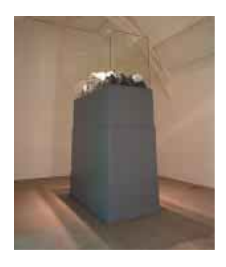
Far Into the Day 2000 Mixed media including wood, acrylic glass and fibre glass 126 x 244 x 410 cm Collection of the artist, Galerie Barbara Thumm

inspired to paint his own iconic pictures of his national landscape of fjords and forests, but as a rough 'provincial' from another country he was so tormented by his fellow students at the Düsseldorf academy that he ended mad, living in an asylum and reduced to painting his now imaginary landscapes on cigarette papers with tobacco water, so that they became postcards from an inner hell. Does Neudecker, herself from Düsseldorf, know this? Or is it another of those strange crossings of paths? At any rate, it adds another layer of meaning to her Deluge (1998), in which a forest landscape by Hertewig (c.1865) is projected along with Francis Danby's Deluge (1840) – an axiomatic Romantic image of the Apocalypse – on video monitors facing each other in a darkened space. The images curve back to form globes or planets, spinning in the dark, advancing and retreating, to a deafening soundtrack of wind and thunder. These are landscapes of the mind, tormenting and tormented. In their constant repetition they suggest a continuum, but also they seem prophetic. Coming it seems from