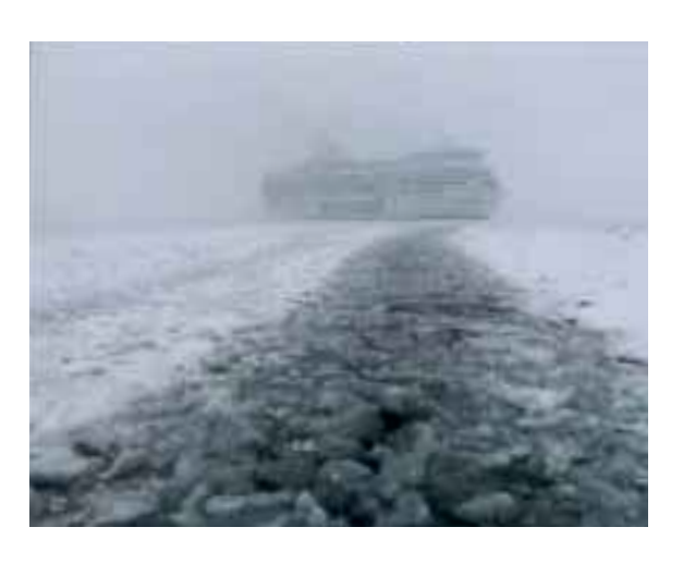
Winterreise 2003 Der Leierman (The Hurdy Gurdy Man) Film still Commissioned by the Contemporary Art Society Special Collection Scheme on behalf of Leeds City Art Gallery with Funds from the Arts Council Lottery, 2003 (in collaboration with Opera North)

and changing creations, our response to them is modified by memory, culture, language, imagination too, and changes to the earth's surface and climate mean that no map can be for ever. Hers are moulded into contours, which they may or may not actually describe. Or she has created new ones, excavating the contours of the English Channel – and glimpses of life in England and France – from a photo album found in a thrift shop, or making a parallel universe from maps drawn from memory.