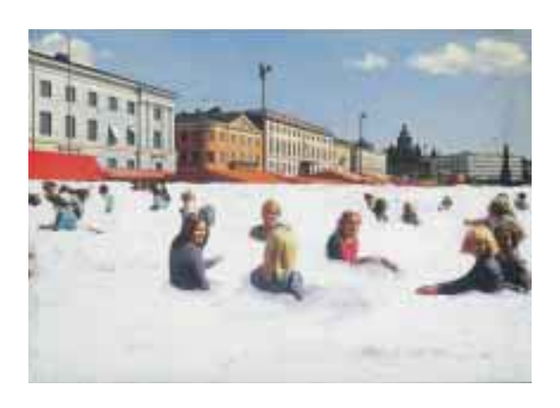
Do You Come Here Often? 1993 Cibachchrome of manipulated postcard on foamboard on MDF 42 x 59 cm Collection of Lotta Hammer

one of those artists who make the weather – literally, by her concoctions of water, salts and dyes – but also in the predictive sense. The way she shows is not reassuring. She is not alone in working with weather, or simulating natural effects. Is this because we all sense a great change coming? Do we want memorials or reminders before disaster strikes? Watching the reactions to Olafur Eliasson's misty sun at Tate Modern – the Turbine Hall itself containing it like a vast case – it was impossible to believe that these were just about the British obsession with talking about the weather that the artist himself claimed. There was a sense of elegy as well as wonder. But it would be wrong to end on a doomy note. Neudecker says people have sometimes missed her humour; she would not want to seem too serious – too German. In one of her altered photographs (1993), she hints at a new ice age. Helsinki, again, appears in what looks like a standard tourist's postcard. But this time, a group of people are buried almost to their necks in snow. They seem happy enough, chatting and playing, and it has not yet covered the various layers of the city's