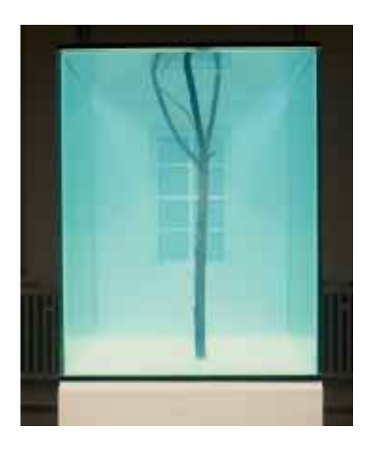
Who Has Turned Us Around Like This? 2002 Glass, water, acrylic medium, salt, fibre glass, plastic 50 x 125 x 170 cm (including plinth) Collection of the artist, Galerie Barbara Thumm

modelled on Friedrich's own, from a different exterior in which a tree is shrouded in fog. With their small, sometimes miniature scale, the tanks invite us to look down into their subjects as well as walk around them, much as Friedrich's own viewpoints sometimes hover somewhere above ground level, thus eliminating the conventional landscape foreground.