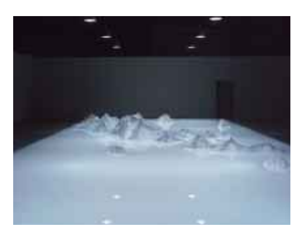
Unrecallable Now 2001 Installation Yokohama International Triennale Glass and metal tank, water, acrylic medium, fibre glass 120 x 850 x 1950 cm Collection of the artist, Galerie Barbara Thumm