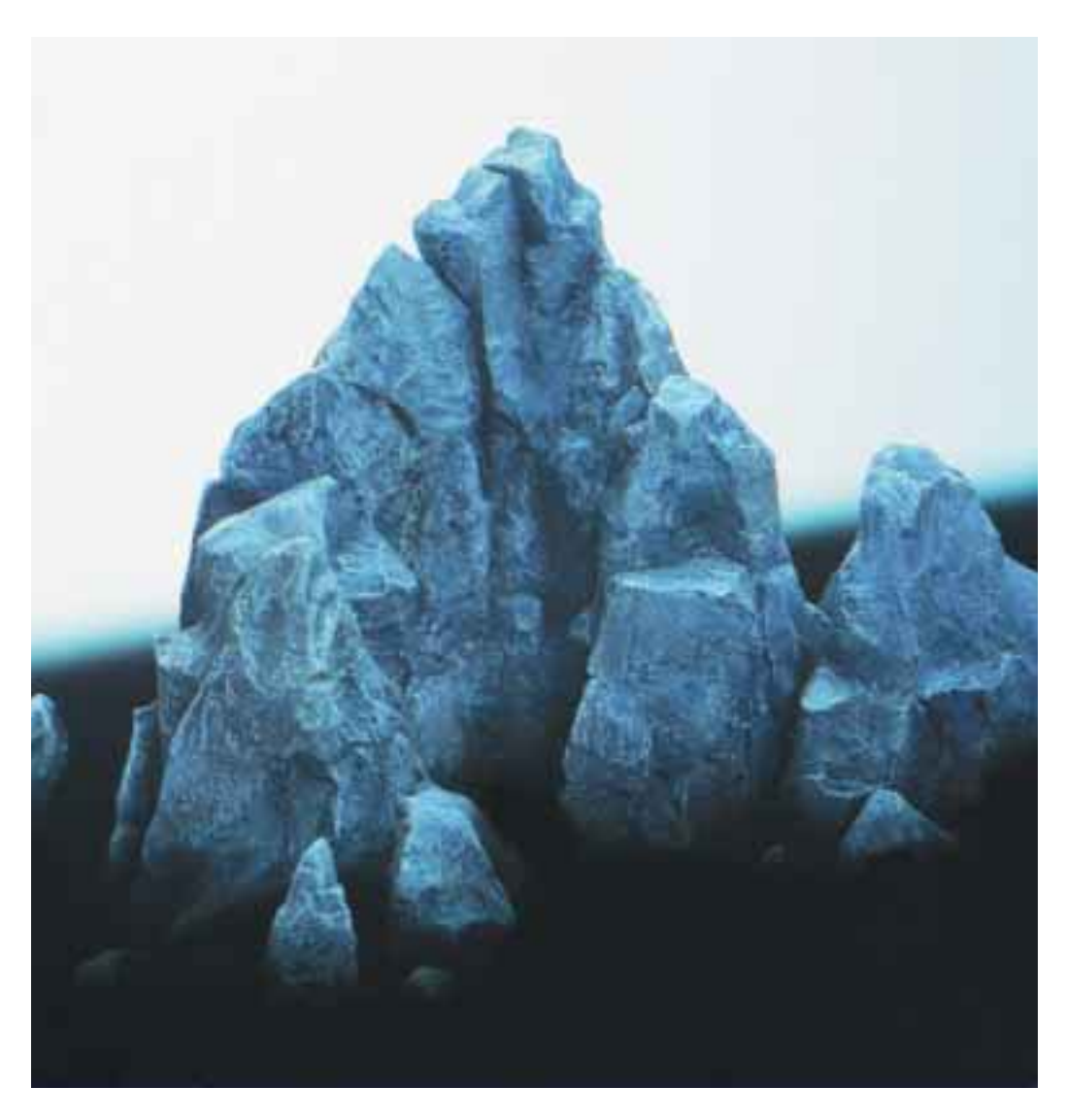
There Go I 2004 detail