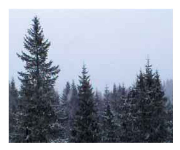
Winterreise 2003 Rast (Rest) Film still

futile search for a vanished woman, in L'Avventura (1960) leaves the 'road of meaning open and as if undecided'. In the cold Taormina dawn, where the film stops arbitrarily, we are left only with unanswered questions.