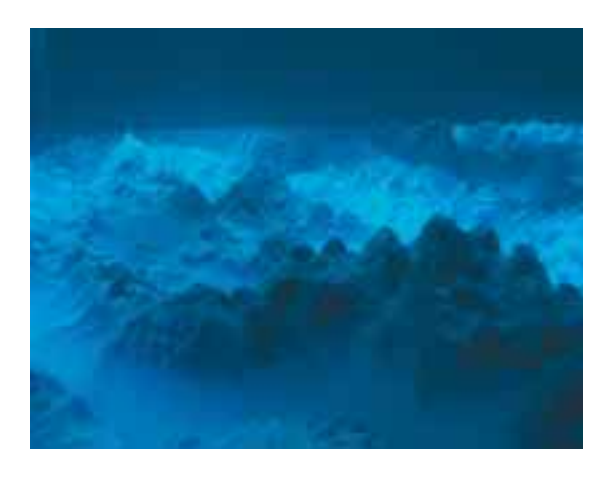
It is a Good Thing to Lose Control Sometimes 2000 detail Glass, water, acrylic medium, salt, fibre glass, plastic 106 x 124 x 136 cm (including plinth) Collection Thyssen Foundation, Vienna

Sometimes (2000) shows her own love of looking down, of the aerial survey, in its almost limitless range of mountains spread out low in their case, while the Romantic disposition to altered states is acknowledged in the title with, perhaps, a hint that such traditions exert their own undue 'control'. The archetypal German forest has been a recurrent theme. At Tate St Ives, it is represented by Things Can Change in a Day (1998), its title expressing her preoccupation with time and its mutations. I Don't Know How I Resisted the Urge to Run (1998) presents the forest, the trees swimming in mist, as a primeval space or realm of the subconscious. The title hints at the alarms therein and the fears they bring – not least of those who have corrupted such symbols by their evil nationalism. The work is both beautiful and creepy. Even without a name, it would be spine-tingling. Its trees are half-dead, rotting in the damp earth of the forest floor. Far into the Day (2000) carries the idea of decay and corruption further. Some crumbling, eroding mountains, dotted with dying trees, are contained within a case that is mounted on a cenotaph-