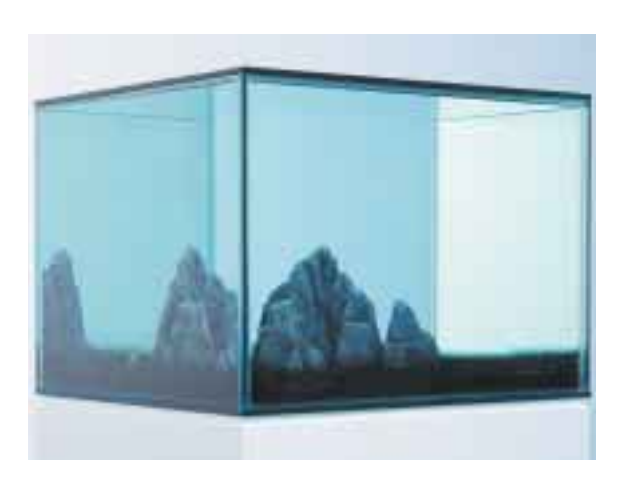
There Go I 2004 Glass, water, food dye, salt, fibre glass 44 x 57 x 63 cm plus plinth Courtesy the artist, Galerie Barbara Thumm Photograph Woodlev and Ouick

been compelled to reinvent the sinister island in the round, to imagine its other side. Its pointy rocks and trees rise from a sea of deepest blue-black. Neudecker has left out the boat bearing its passengers to the island. But look carefully, both on the side of the island borrowed from the picture and on the other, and there are two tiny landing stages, awaiting its arrival. She wanted to make something that was 'cold and deep', that evoked the North, that was 'deadly – not warm or paradisical'. Hers is certainly not the Romanticism of the South, that longs, with Goethe, for the lands of the lemon tree. But it is not without humour at least. Once again here, she has followed an artist's lead on a voyage into the subconscious; it is helpful to have a choice of two landing places.