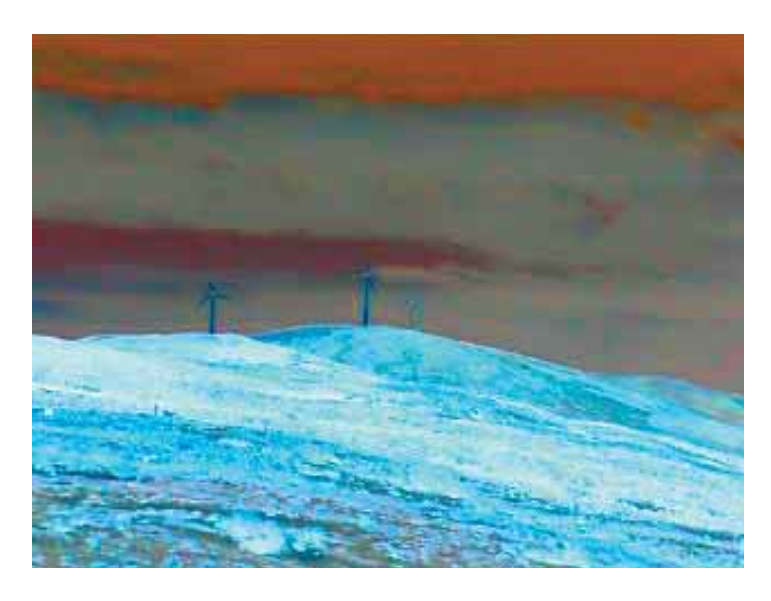
Winterreise 2003 Die Nebensonnen (The Phantom Suns) Film still Commissioned by the Contemporary Art Society Special Collection Scheme on behalf of Leeds City Art Gallery with Funds from the Arts Council Lottery, 2003 (in collaboration with Opera North)